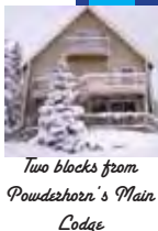
Two blocks from Powderhorn's Main Lodge

Close to Wolverine & ABR Cross-Country Ski Trails