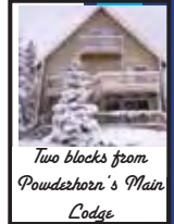
Two blocks from Powderhorn's Main Lodge

www.windsong-lodging.com Ph: 920-427-6086 E-mail: windsonglodging@yahoo.com