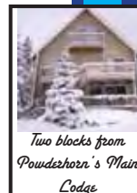
Two blocks from Powderhorn's Main Lodge