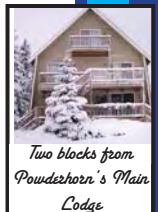
Two blocks from Powderhorn's Main Lodge