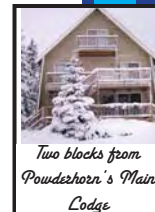
Two blocks from Powderhorn's Main Lodge