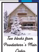
Two blocks from Powderhorn's Main Lodge

www.windsong-lodging.com Ph: 920-427-6086 E-mail: windsonglodging@yahoo.com