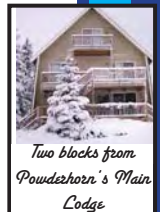
Two blocks from Powderhorn's Main Lodge

• Hot Tub $80 - $135 • Wi Fi Nightly • Kitchens Close to Wolverine & • Pet Friendly ABR Cross-Country Ski Trails www.windsong-lodging.com Ph: 920-427-6086 E-mail: windsonglodging@yahoo.com